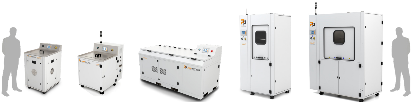
See our full product line at postprocess.com/products

Designed solely for industrial AM, our suite of intelligent solutions are ideal for even the most complex and delicate parts, including those with internal geometries. Delivering unparalleled consistency, throughput, productivity, PostProcess allows customers to realize the full potential of additive manufacturing.