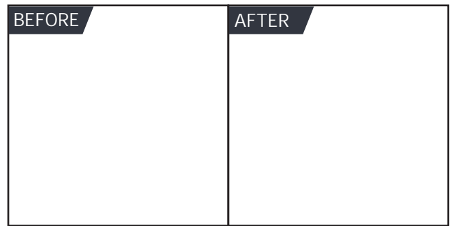
Before: FDM Technology, ABS Build Material, SR30 Support Material

Automated and intelligent solution to these problems, with a combination of unique technologies that will help unlock scalable industrial 3D printing.