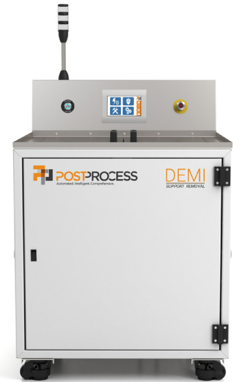
PostProcess™ DEMI™ Resin Removal Solution