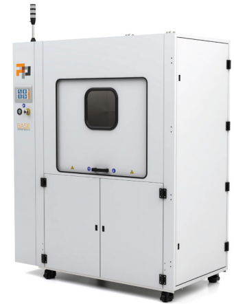
PostProcess™ BASE™ Support Removal Solution

In respect to return on their investment, the BASE has brought Toro closer than ever to achieving their ultimate “build time = lead time” goal. “It’s integrated very well into our value stream. We went from spending two times the build time to clean parts to spending only 4% of the build time on average. That’s a tremendous improvement. Now, it’s very rare that something takes us more than a couple of hours to clean and remove all of the support from,” stated McArdell. Plus, between an average 89% decrease in post-print process times and over a 90% decrease in operator labor, the workflow efficiencies that the BASE has opened up haven’t just saved Toro resources, it’s allowed them to redefine their product offerings, as well.